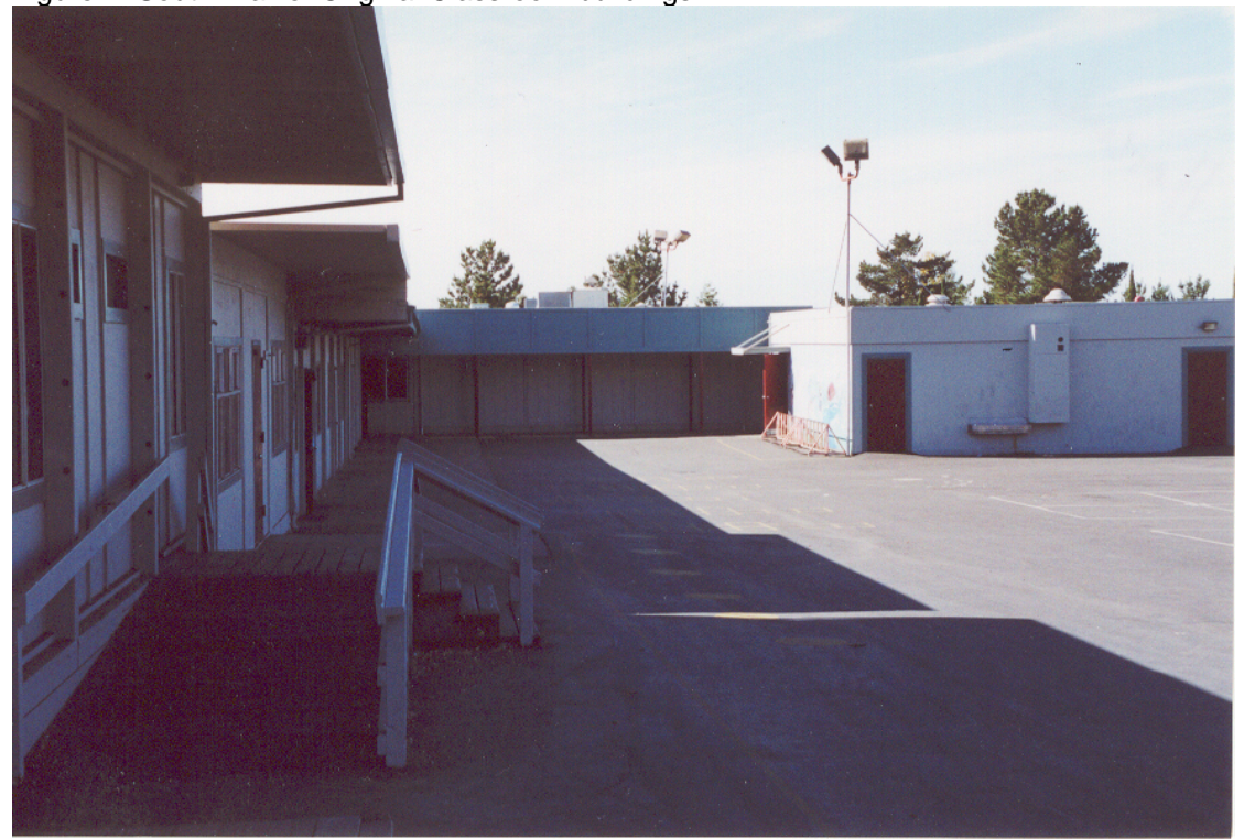
Figure 5: North Wall of Original Classroom building (Room numbers 1 through 4)