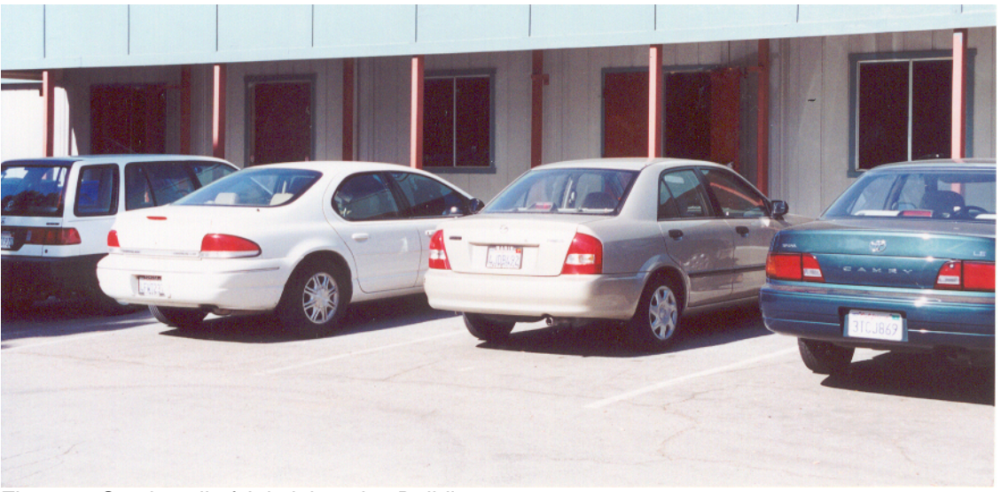
Figure 3: South wall of Administrative Building