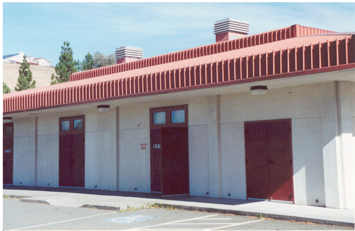
Figure 6: West Wall of Multi Purpose Building