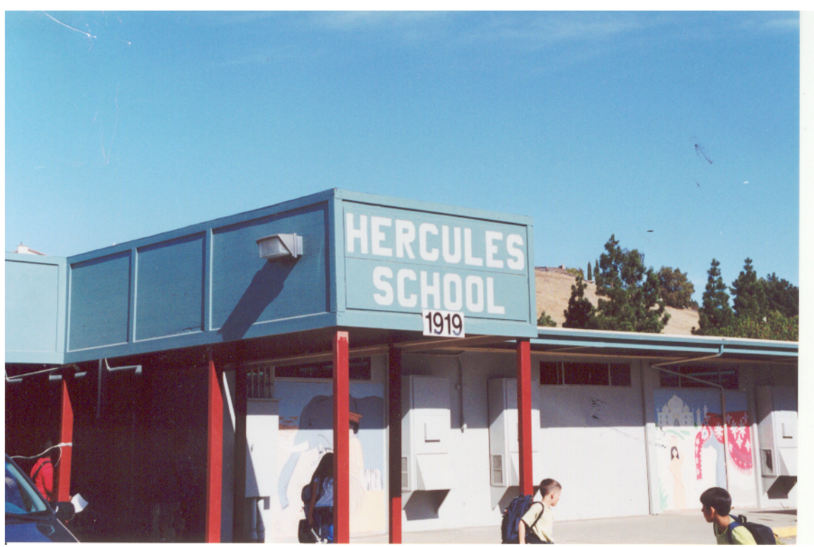
Figure 2: Main Entrance