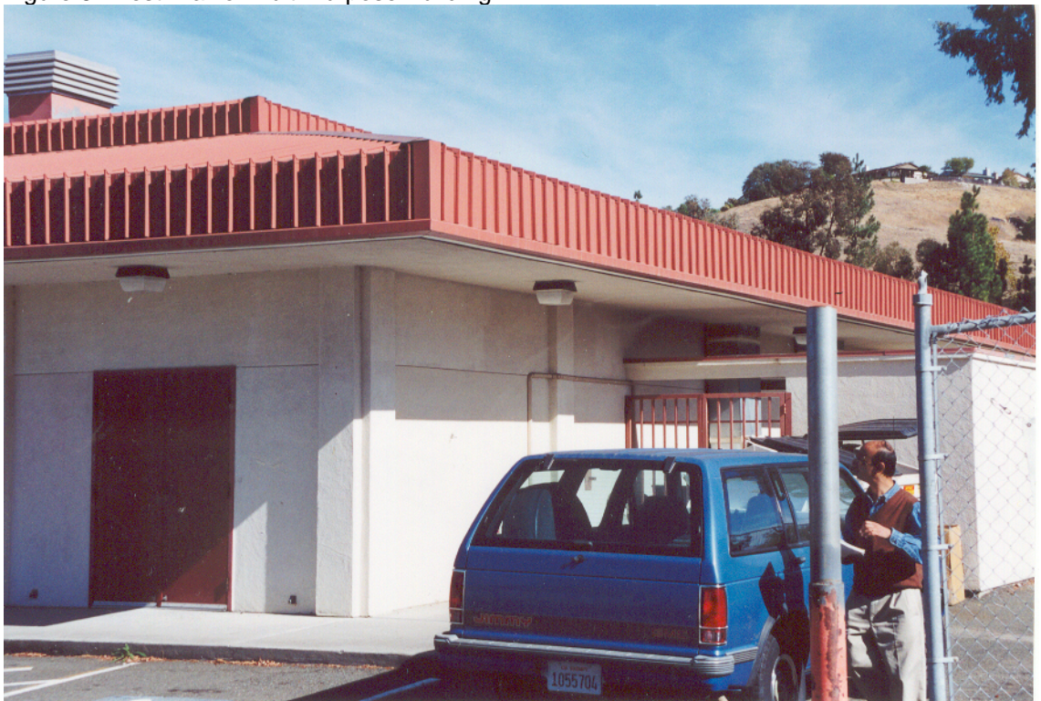
Figure 7: Multi Purpose Building